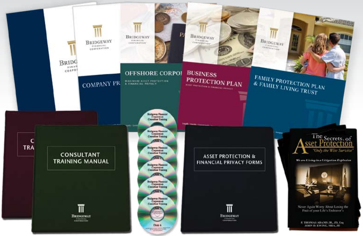
A COMPLETE PACKAGE OF SALES MATERIALS