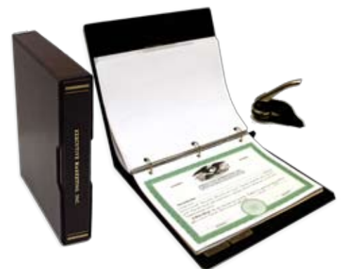
YOUR OWN CORPORATION

"I can't say enough about how much I like your program. It is easy to understand!"