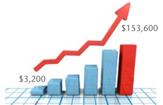
POTENTIAL MONTHLY SALES OVERRIDES

Only Consultants enjoy a $400 - $800 residual income on the sales of their Associate pool. Your organization builds fast!